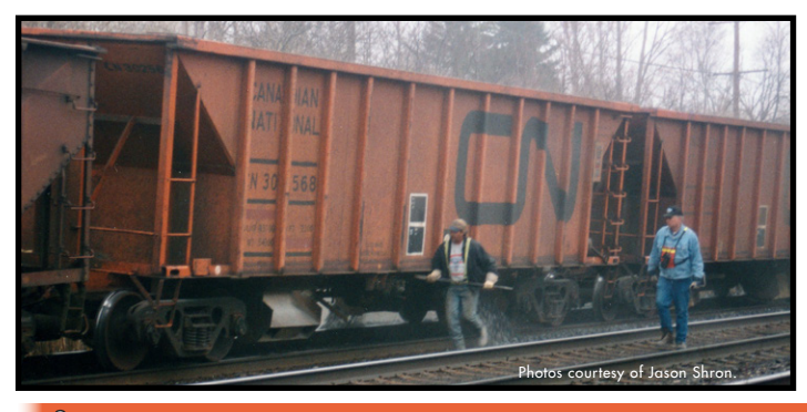
Road # 965545, 965551, 965593, 965657, 965668, 965685